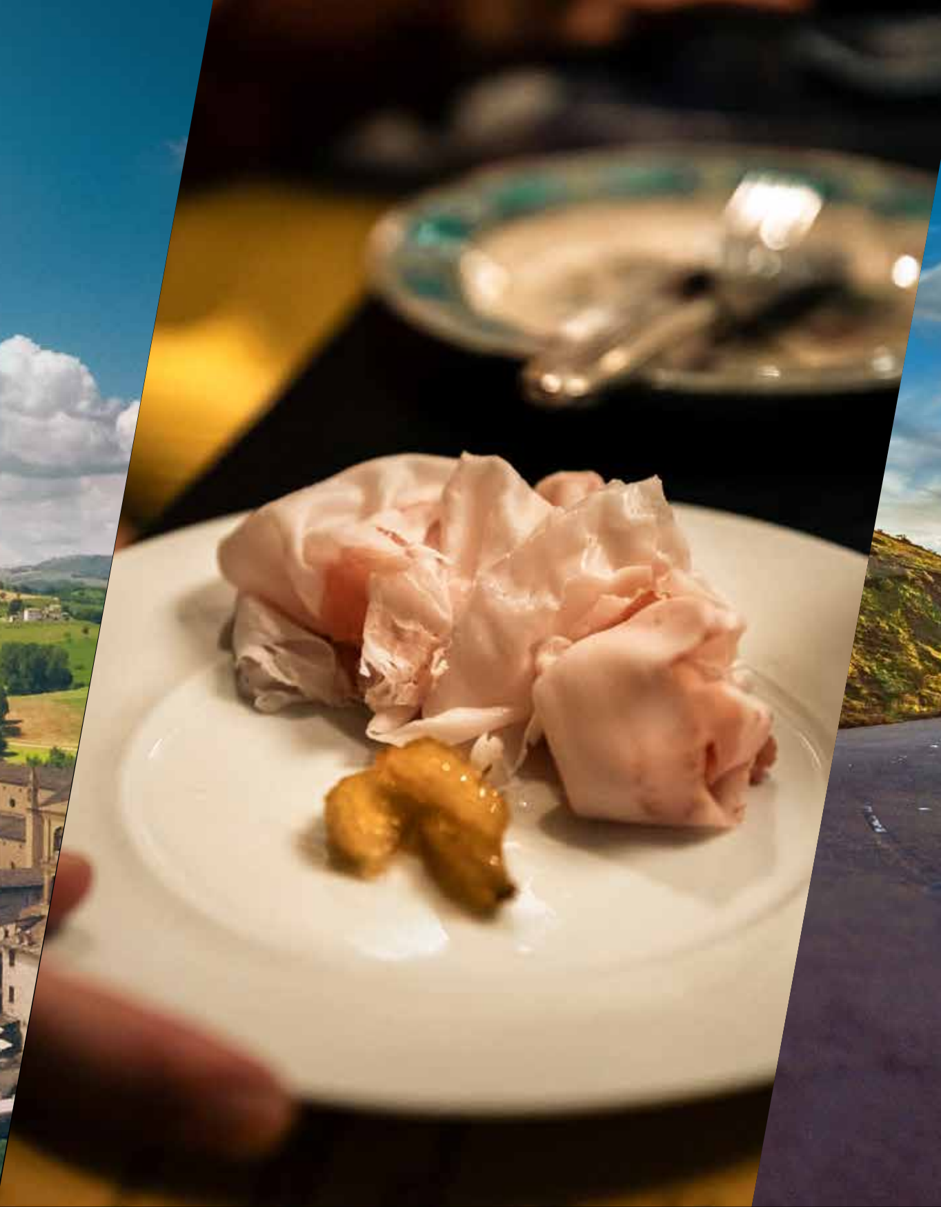
Typical Modenese cuisine