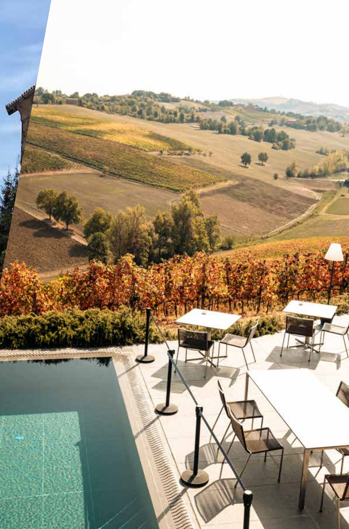
Opera 02 (lunch stop)