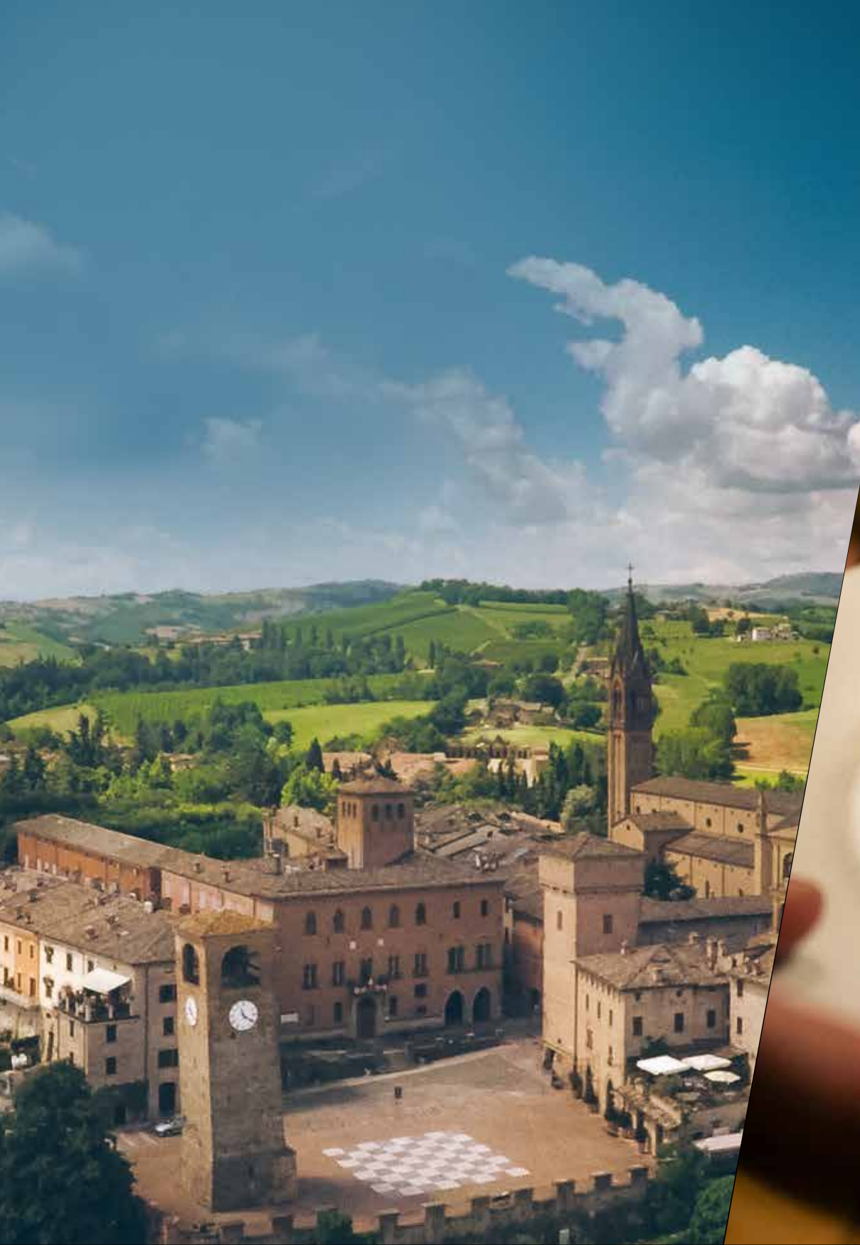
Castelvetro di Modena