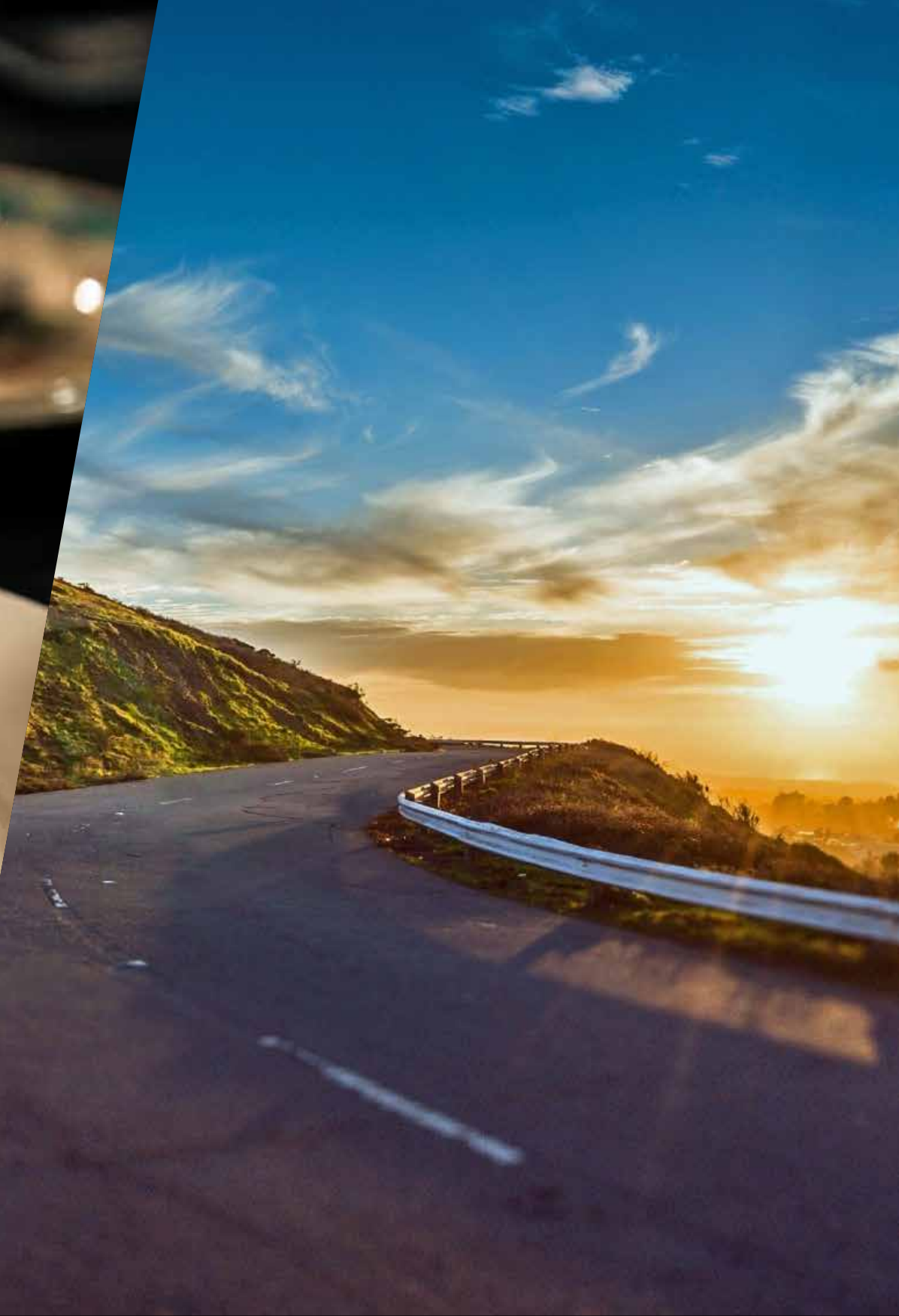
Scenic roads of Modena Apennines