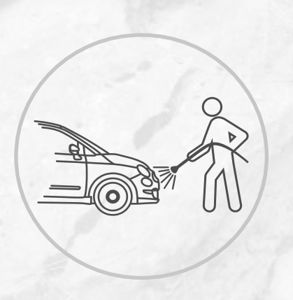
SANITIZED CARS BEFORE EACH TOUR