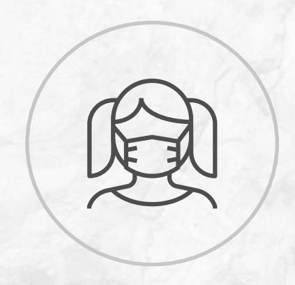
OUR STAFF WILL WELCOME YOU WITH MASKS and a friendly smile

All operators involved in the tour comply with safety regulations and will do their utmost to ensure that physical distance does not prevent us from sharing our common passion.