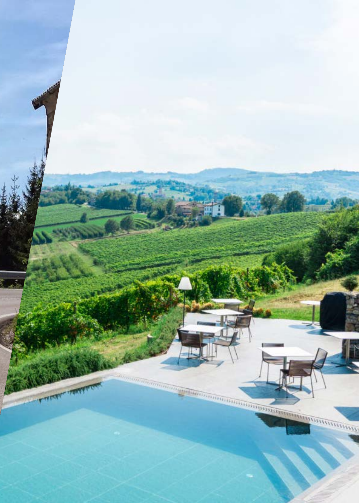
Opera02 (lunch stop)